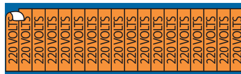
Style C: 2-1/4" x 1/2" (18 markers per card) Character Height 5/16"