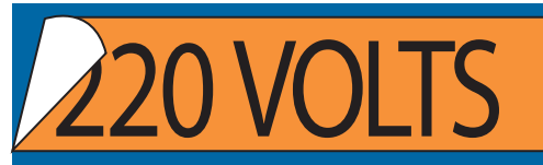
Style A: 2-1/4" x 9" (1 marker per card) Character Height 1-7/8"