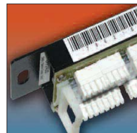
Easy barcode printing!