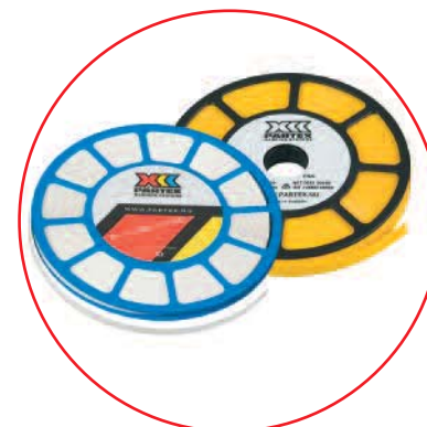
S = COMPACT DISC (MTX-MK9) For profile packaging