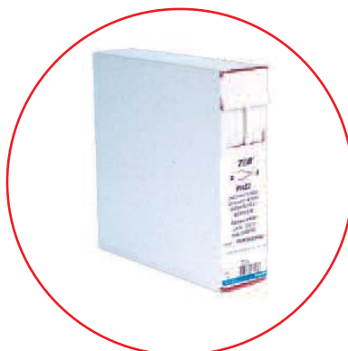
M = MINIBOX