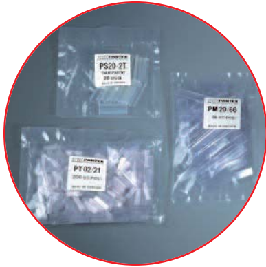
SINGLE BAG Label holders "A" = Cut/Loose markers in a bag