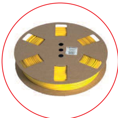
CARTON-REEL Continuous PO profile & Heat Shrink