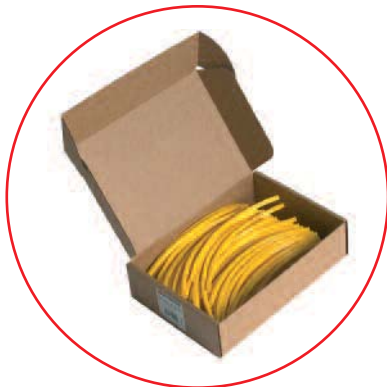
CARTON MTX-MK1 "P" = Semi cut markers in strips (CT)