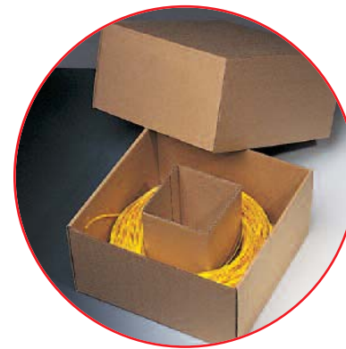
MTX-MK20-SP2000 B = Bulk carton Continuous marker profile