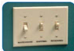
NEW! Clear, Professional, Seamless Labeling