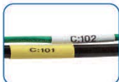
Ideal for Heat-Shrink Applications