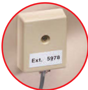
Great for Identification in any Office or Industrial Setting