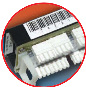
Easy Barcode Printing