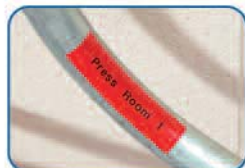
NEW! High-Visibility Indoor/Outdoor Vinyl Label