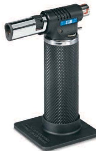
Article No.: WT-PTORCH

Contact your Regional Sales Office for a complete report detailing testing and competitive analysis.