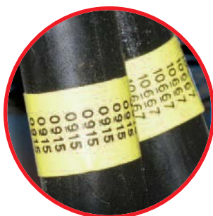
Perfect for Labeling Heavy Cables in Factory or Industrial Environments

No-smear thermal label printing on a wide variety of quality materials and colors!